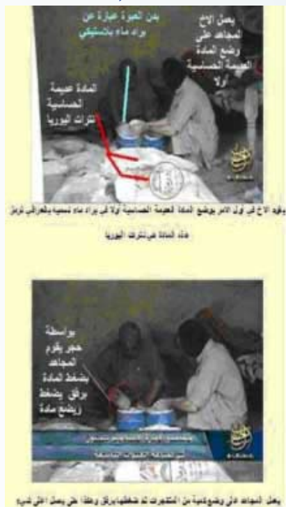
Visual instructions on the Internet in Arabic on how to make homemade explosives.

The Internet has long been a favored tool of terrorist organizations as a means of indoctrinating, spreading propaganda, and recruiting members. But increasingly, websites are now being used to share crucial information on terror techniques, how to manufacture and use explosives, weapons and poisons, how to forge documents and how to withstand interrogation. Most of the material is translated into Arabic from non-Arabic sources. Details on websites include the manufacture of rockets, bombs, mines, and mortars, and instructions for using assault