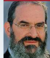
Rabbi Yaacov Warhaftig Chief Rabbinate of Israel Jerusalem, Israel