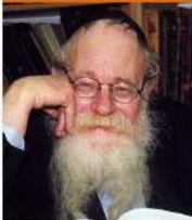
Rav Adin Steinsaltz Teacher, philosopher, author Jerusalem, Israel